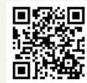
Digital Degree Certificate QR Code